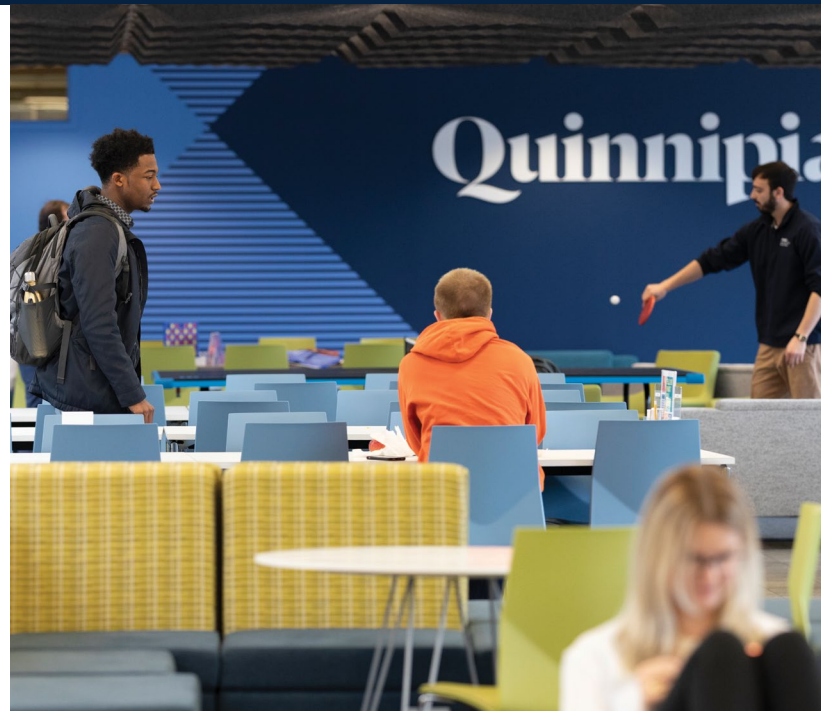
Recent renovations to the Larson, Perlroth and Troup residence halls (pictured above, left) as well as to the cafeteria on the North Haven Campus are representative of the design style planned for the Complex residence hall later this year.