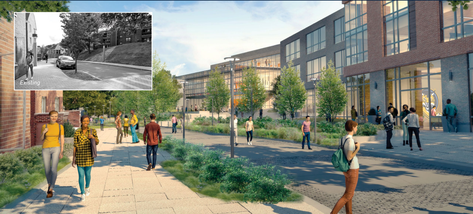
Proposed rendering of Mount Carmel Campus Bobcat Way, looking east at new housing and new "Bobcat Hub"