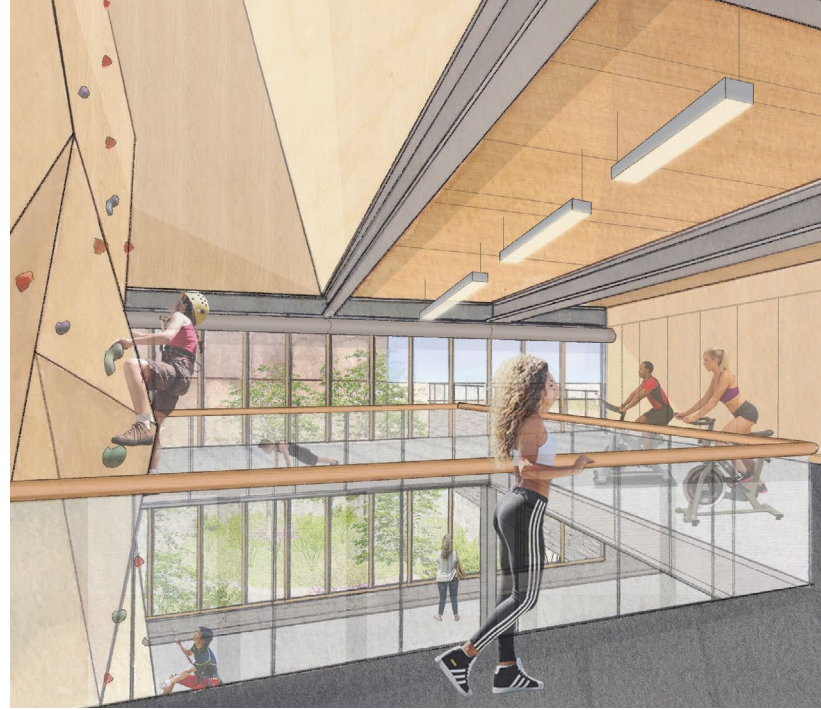
Renderings of the entrance to the new Recreation & Wellness Center, as well as interior activity and exercise spaces.