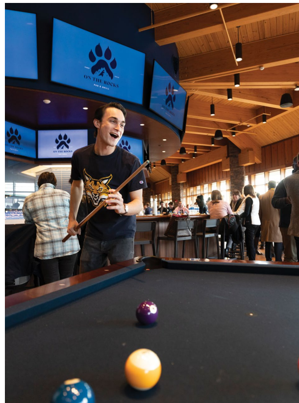
A recent renovation to the York Hill Campus included the creation of On the Rocks Pub & Grill as a new social hub for a vibrant student life.

The Complex residence hall, built in 1983, will be renovated in Summer 2021. The built-in furniture will be removed, and the current 6-person, 3-bedroom apartments will be converted to house 4 students with 2 singles and a double. Current plans are to have juniors and seniors residing in the newly renovated Complex. Upgrades to the kitchens and bathrooms and new furniture will transform the hall into a fresh, modern living space.