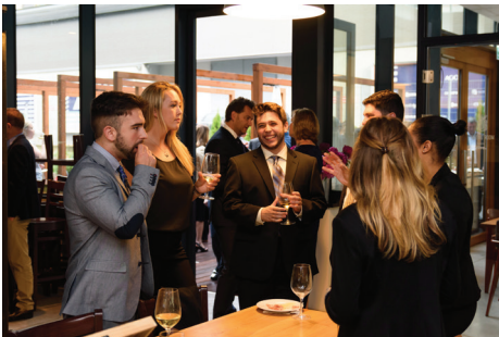
Participants at the CEI second annual Mielżyński executive networking and alumni event.