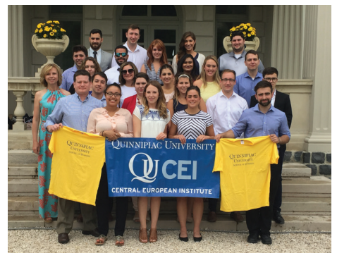
Students traveled to Hungary and Poland for the annual MBA trip from May 29 to June 10, 2016.