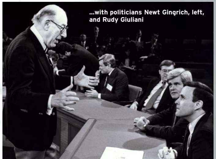
...with politicians Newt Gingrich, left, and Rudy Giuliani