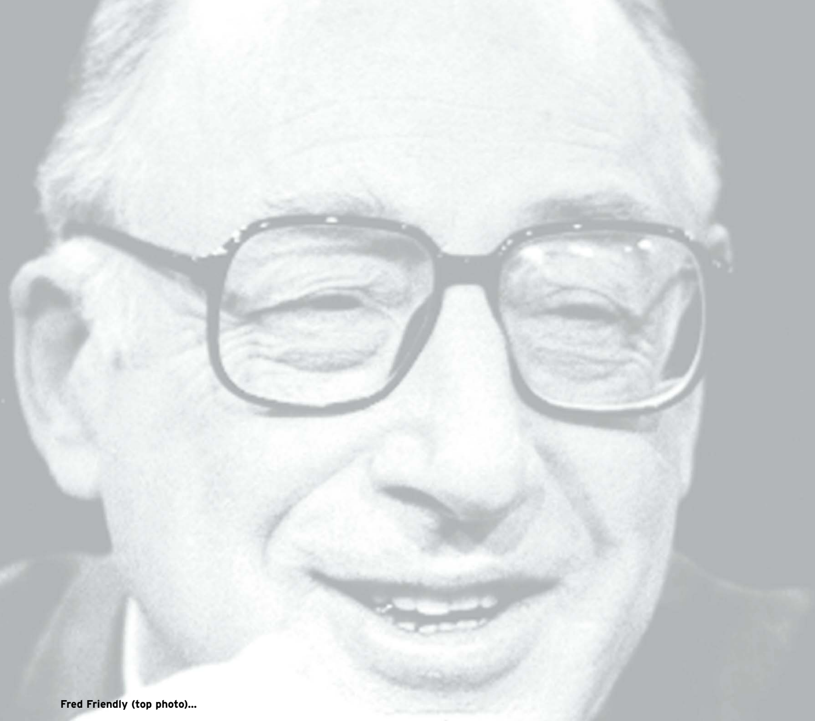
Fred Friendly (top photo)...