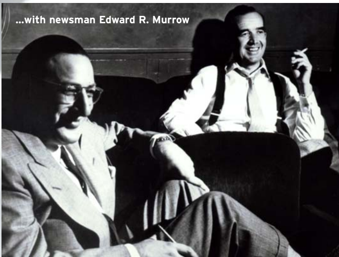
...with newsman Edward R. Murrow